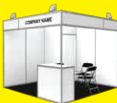
Exhibit Space Cost